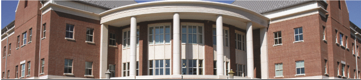
Salisbury university Seidel School of Education Fall 2020