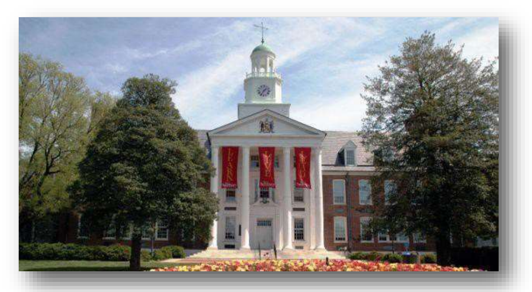
Salisbury University has a strong institutional commitment to diversity and is an Affirmative Action employer, providing equal employment and educational opportunities to all those qualified, without regard age, class, citizenship, color, disability ethnicity, gender, genetic information, immigration status, national origin, race, religion, sexual orientation, and veteran status.